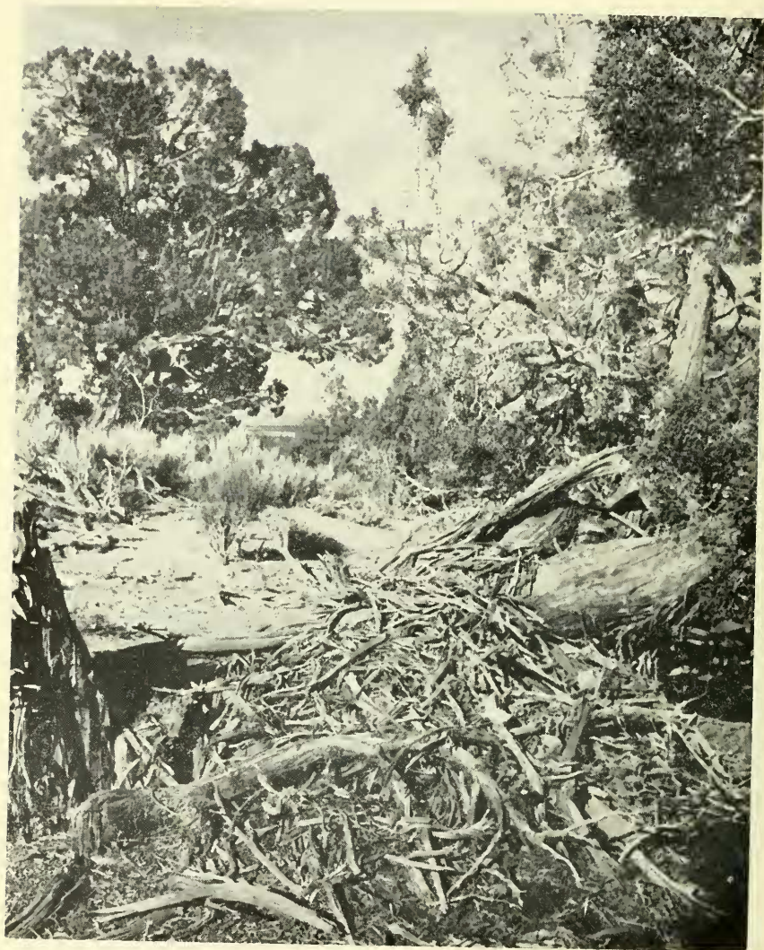
Fig. 2. The woodrat house.